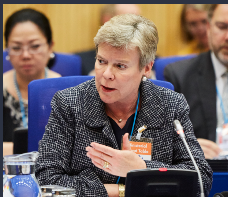
Rose Gottemoeller, U.S. Under Secretary for Arms Control and International Security

the Preparatory Commission to complete the Treaty’s verification regime and help enhance